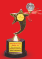
ASSOCHAM National Education Excellence Award 2017 for Best Innovation and Skill Development